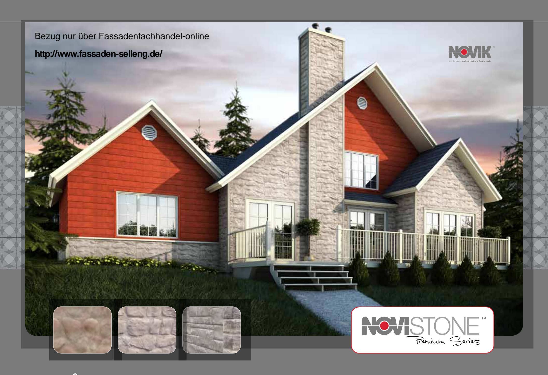
(Inveil nature's beauty and richness...